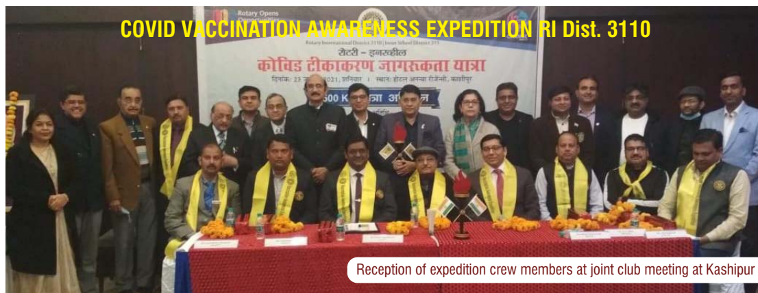
Reception of expedition crew members at joint club meeting at Kashipur